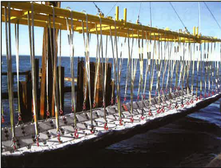
An articulated concrete mattress is set in place.

contractor's largest wastewater project, the $130 million Gowanus Pumping Station in Brooklyn, NY.