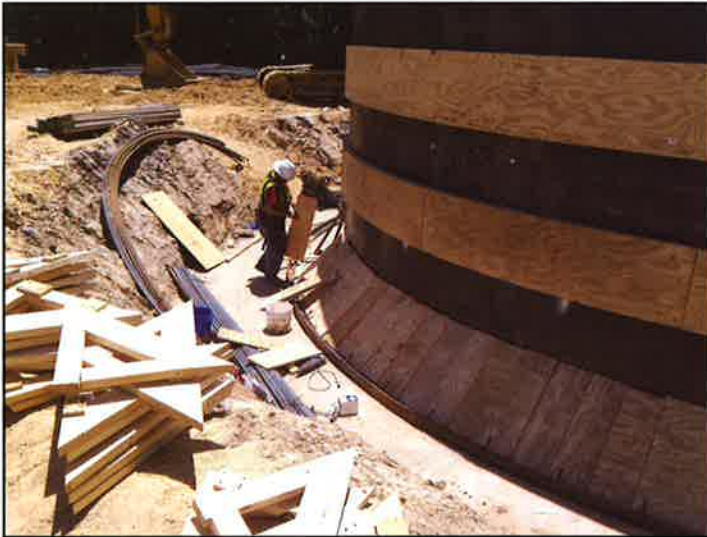
An angled cutting shoe is installed on a project.

Approximately ten years ago, the company further increased its services to include marine construction with the purchase of Caldwell Marine. Caldwell continues as one of the top firms in submarine cable installation and heavy marine construction. The company has completed projects in New York, New Jersey, Alaska, the Gulf States, the Caribbean, Vancouver Island, and many additional locations over the years. On a project for the Bayonne Energy Center, Caldwell successfully completed the installation of the three-phase 345kV BEC transmission power cable system across New York Harbor. On another project, the firm installed two 180 foot steel transmission towers supporting new 230kV transmission lines spanning the Mullica River. Caldwell Marine is currently installing 5 miles of 35kV cable in Martha's Vineyard for NSTAR Electric Co.