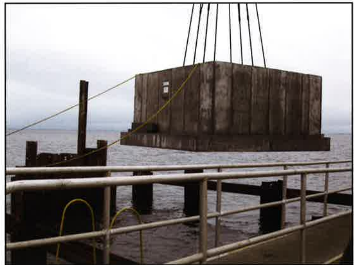
Northeast installs a shore diversion chamber.