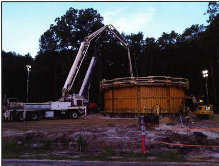
Northeast installs a 36 inch diameter caisson in Charleston, SC.

In 2010, Northeast purchased Huxted Tunneling which is located in Florida, allowing the firm to expand its geographic reach. Huxted has also successfully installed over 50,000 feet of pipe via microtunneling and is completing tunnel projects in Florida, Texas, New Hampshire and South Carolina. Collectively, Northeast and Huxted own the largest fleet of microtunneling equipment in the country.