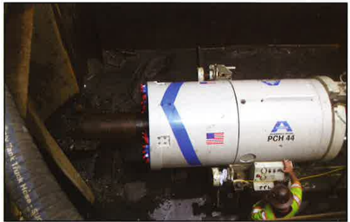
The firm operates a PTMT power cutting head.

Throughout the years, the company has been able to attract and retain many talented individuals who have contributed to the firm's success. The company views these employees as its backbone and greatest asset. To accommodate growth and future expansion, Northeast is in the planning stages of constructing a new headquarters on Route 34 in Wall, NJ.