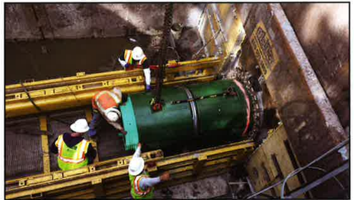
Launching of Huxted MTBM at Sun City Center in Florida.

By the 1990's, Northeast was completing projects in Delaware, Pennsylvania, Connecticut and New York City. The company's first New York City project involved the installation of pipe under Route 440. Northeast determined that the best method to install the pipe would be to use microtunneling due to the existing soil conditions and high water table at the site. The successful use of this technique enabled the company to expand its operations into the microtunneling field. Since that time, Northeast has installed over 50,000 feet of pipe via microtunneling in numerous states