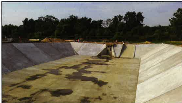
A sludge storage lagoon is completed.

Another area of diversification is in the water and waste water treatment construction arena. Northeast acquired Remsco Associates in 1995 and has successfully completed projects at the Sayreville Water Treatment Plant, the Swimming River Water Plant, New Brunswick Water Treatment Plant, North Hudson Sewer Authority and the Canal Road Water Treatment Plant. Currently, Northeast Remsco is completing an upgrade for the New Jersey Water Supply Authority at the Manasquan Water Treatment Plant. This project involves installation of two tanks, rehabilitation of sludge lagoons and an equalization basin as well as other upgrades to the facility. Northeast Remsco also continues to construct the